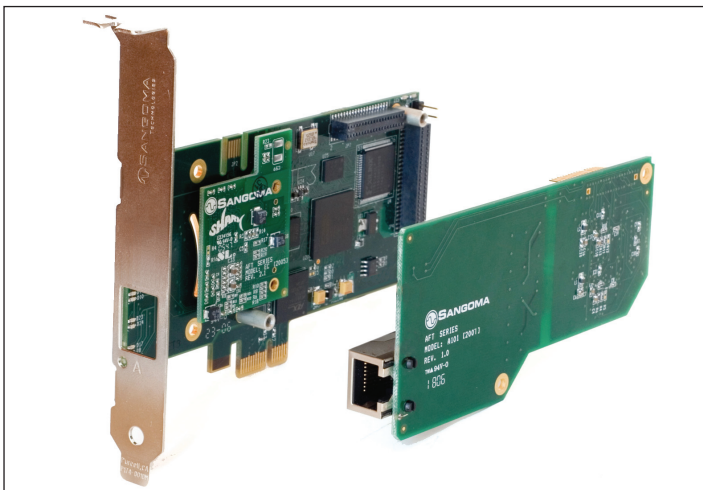
A101D-X PCI Express Interface with Hardware Echo Canceller supporting up to 30 simultaneous calls over a single T1, E1, or J1 port.

Choose the Sangoma A101D and A101D-X cards with Octasic's DSP hardware and certified algorithms to achieve carrier-grade echo cancellation and Voice Quality Enhancement functions on your open source or even proprietary telephone system.